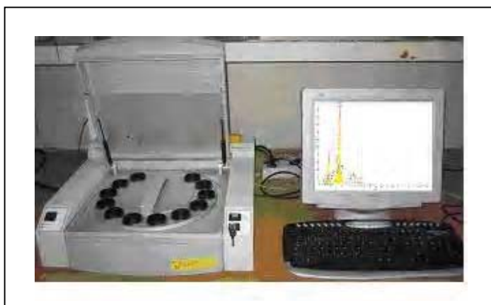
Figure 2. PW4025 EDXRF spectrometer.

The apparatus used is a PW4025 – MiniPal – Panalytical type EDXRF Spectrometer (Figure 2).