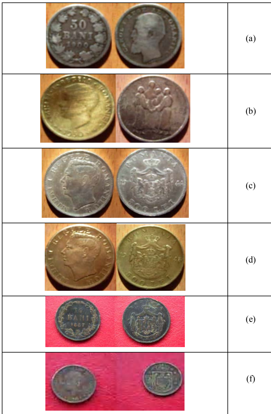
Figure 1. Romanian coins used for the study (see Table 1): (a) coin #1, (b) coin #2, (c) coin #3, (d) coin #4, (e) coin #5, (f) coin #6.