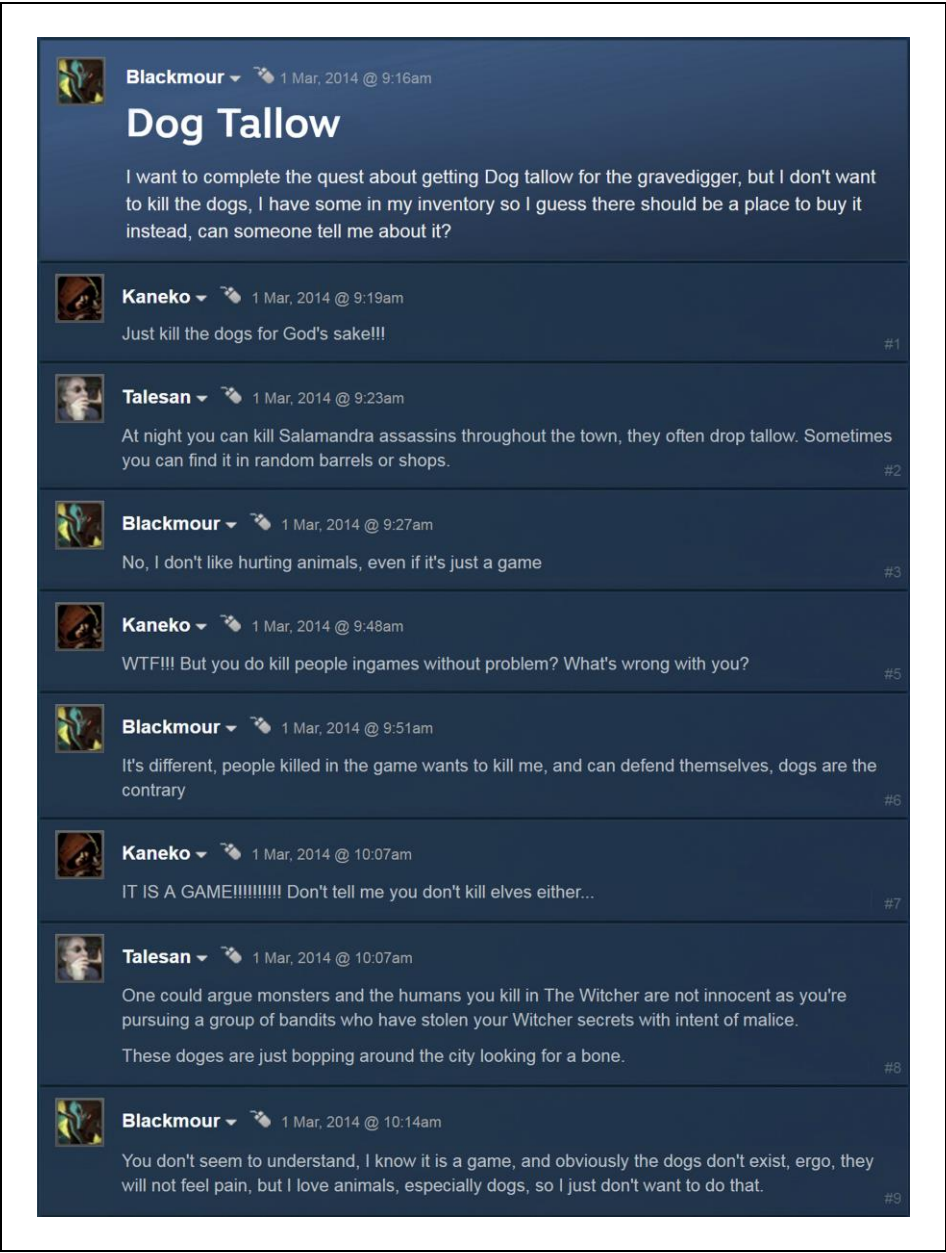
Figure 2. A part of Steam discussion about The Witcher's side-quest The Dogcatcher of Vizima.

tallow as proof of completing the task. In fact, the real task is to collect 6 pots of dog tallow and bring them to a gravedigger.