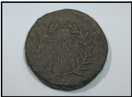
Figure 7. Wreath symbol in the Antipas bronze coin, minted in Tiberias (AGDB, 2019).

taxes for the Empire and try to maintain order and peace in Judea. To avoid frictions with the Jewish community, they kept the same style that was used by the Hasmoneans and by Herod in their coinage, leaving aside the portrait of roman emperors or gods. However, they used symbols that marked the influence of the Roman administration with the inscription KAICAPOC (Caesar).