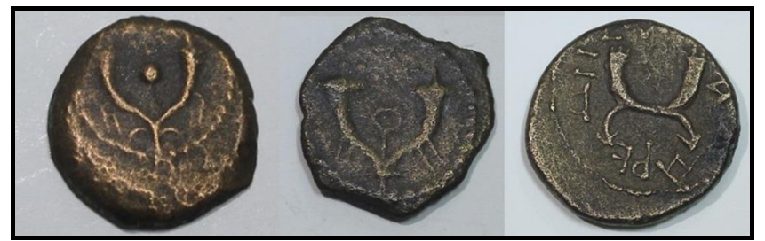
Figure 8. Cornucopia symbol in Hasmonean bronze coin with pomegranate between horns 104 - 76 BCE (left), Herodian bronze coin with caduceus between horns 4 BCE - 6 CE (center), Roman Provincial coin under Nero with crossed cornucopia 67/8 CE (right) (AGDB, 2019).