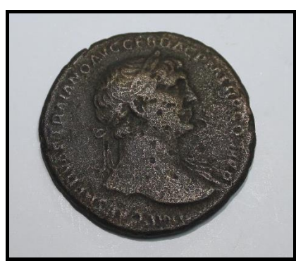
Figure 2. Roman bronze sestertius, of Emperor Trajan (AGDB, 2019).

In the region of Asia Minor, the Lydian Empire had a strong Greek influence due to the geographical, commercial and Greek poleis development conditions. This influence was represented in the artistic and architectural expressions of the Lydian inhabitants, such as the agora found in Sardis, the Lydian capital. So far, it is the Lydian Empire to whom is attributed the minting of the first coin made of electrum (an alloy of gold and silver) [2] between years 650-560 BCE.