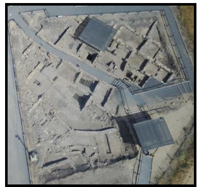
Figure 10. Ritual area (A/F) of Magdala (Magdala Archaeological Project, 2017). Percentage of coins' groups found in the ritual area (A/F) of Magdala: 49% Hasmonean, 20% Herodian, 5% Roman Governor, 6%. Autonomous (Tyre/Sidon), 4% Roman Provincial, 3% Judean, 2% 1<sup>st</sup> Jewish Revolt, 1% Roman Imperial, 11% Others.