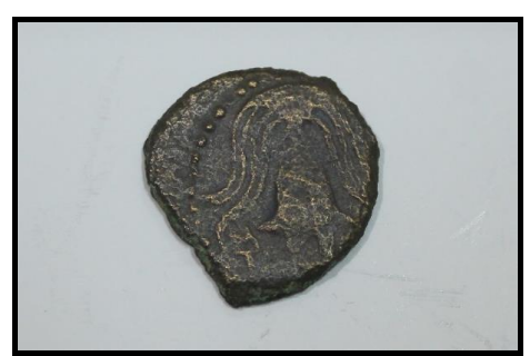
Figure 4. Helmet symbol in Archelaus bronze coin (4 BCE – 6 CE) (AGDB, 2019).

and joined cornucopia facing one another with a pomegranate in between. The joined cornucopia style with the pomegranate was an original Hasmonean designed ([4] groups A, B, D, E, F, I, P, Q, R, S, T, U) symbolizing the 'fruit of victory'. The pomegranate was the representation of stability and greatness of the Jewish people. The Herodian coins [4, p. 223-224] style, kept using the joined cornucopia, but they replaced the pomegranate with a roman caduceus between horns (Figure 8).