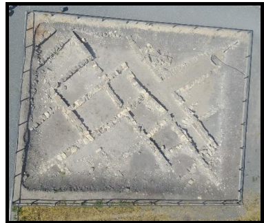
Figure 12. Domestic/Storage area (B) (Magdala Archaeological Project, 2017). Percentage of coins' groups found in the domestic/storage area (B) of Magdala: 47% Hasmonean coins, 22% Herodian, 0% Roman Governor, 5% Autonomous (Tyre/Sidon), 1% Roman Provincial, 5% Judean, 1% 1<sup>st</sup> Jewish Revolt, 1% Roman Imperial, 18% Others.

Figure 11. Market area (E). Half of the market area was excavated by the IAA and the other half by the Anahuac University team (Magdala Archaeological Project, 2015). Percentage of coins' groups found in the market area (E) of Magdala: 50% Hasmonean coins, 17% Herodian, 4% Roman Governor, 7% Autonomous (Tyre/Sidon), 4% Roman Provincial, 1% Judean, 2% 1<sup>st</sup> Jewish Revolt, 0% Roman Imperial, 15% Others.