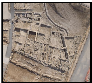
Figure 11. Market area (E). Half of the market area was excavated by the IAA and the other half by the Anahuac University team (Magdala Archaeological Project, 2015). Percentage of coins' groups found in the market area (E) of Magdala: 50% Hasmonean coins, 17% Herodian, 4% Roman Governor, 7% Autonomous (Tyre/Sidon), 4% Roman Provincial, 1% Judean, 2% 1<sup>st</sup> Jewish Revolt, 0% Roman Imperial, 15% Others.

Figure 10. Ritual area (A/F) of Magdala (Magdala Archaeological Project, 2017). Percentage of coins' groups found in the ritual area (A/F) of Magdala: 49% Hasmonean, 20% Herodian, 5% Roman Governor, 6%. Autonomous (Tyre/Sidon), 4% Roman Provincial, 3% Judean, 2% 1<sup>st</sup> Jewish Revolt, 1% Roman Imperial, 11% Others.