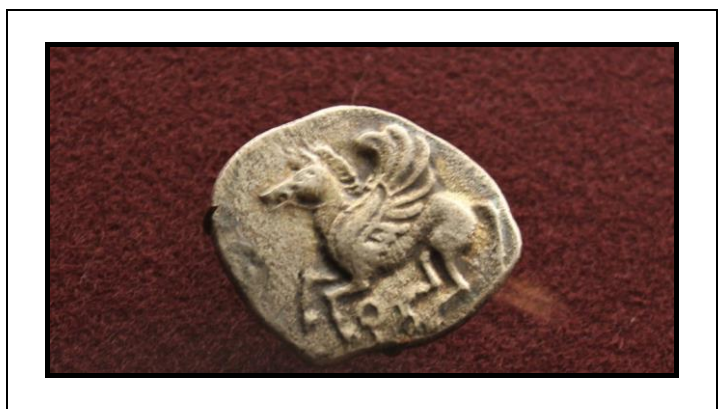
Figure 1. Pegasus on a Corinth silver drachm (AGDB, 2018).

To have a better understanding of the Hellenic influence of the symbols engraved on the Jewish coins found in Magdala, it has to be taken into account the historic transition and the cultural development of the geographical area.