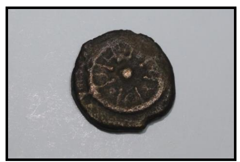
Figure 6. Star symbol in the Jannaeus bronze coin (AGDB, 2019).

During his reign (40-4 BCE), Herod had good political relations with the Roman administration. After his death, Rome decided to rule directly Judea with Roman procurators because there were political tensions with Archelaus, who ruled from 4 BCE - 6 CE. The aim of these procurators (6–66 CE) was to collect