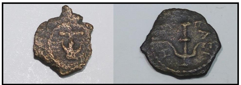
Figure 5. Two examples of anchor symbol. Jannaeus bronze coin (left) and Herod bronze coin (right) (AGDB, 2019).