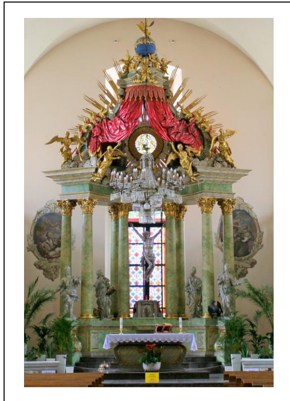
Figure 1. The presbytery of the Holy Spirit Church in Toruń.

Pointing to the role of post-Tridentine art in ones' sanctification, I have selected the decree De invocatione, veneratione et reliquiis sanctorum, et sacris imaginibus [2], Borromeo notes [21] and the Resolution of the Cracow Synod on Religious Painting [22] as reference points. The artworks analysed in this article are the retables of two selected churches. The first one is the main retable in the Holy Spirit Church in Toruń (Figure 1).