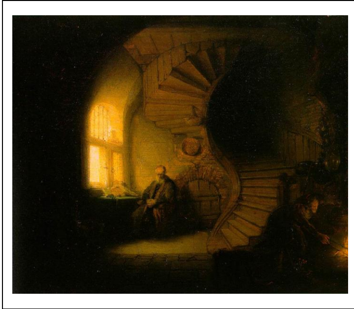
Figure 4. Rembrandt van Rijn, Philosopher in Meditation , 1632 (accessed by Wikimedia Commons)

Also in the Cathedral Basilica in Pelplin, a significance of colours is noticeable in the context of a perception process. The retable seems to be gold, and the paintings show shades of ochre and brown, except for the elements of The Coronation of Mary and the Hand of Divine Providence. The both artworks use blue ( The Coronation includes red as well), which contrasts with gold, strengthens the visibility of the main axis, and its power to attract the viewer's eyes.