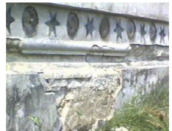
Figure 5. Socle degradation

rations. The roof of the nave is in the form of a wooden frame that follows the shape of the