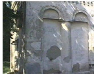
Figure 4. Facade degradation

drawings were executed by folk craftsmen, imitating scribbled models in a clumsy way, however, this is pre-